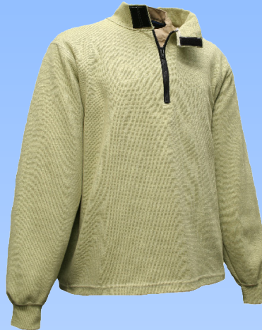
X-Factor Half-Zip Sweatshirt Model # C21CH__HZ