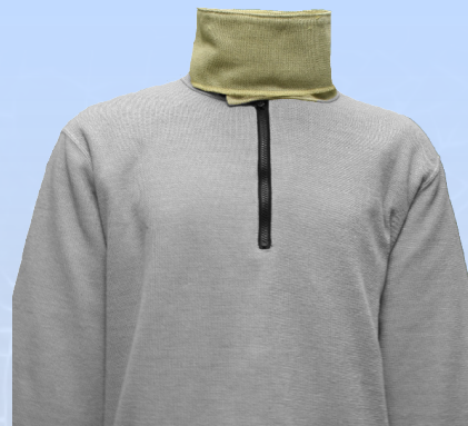
X-Factor Neck Protector Model # H01CH117