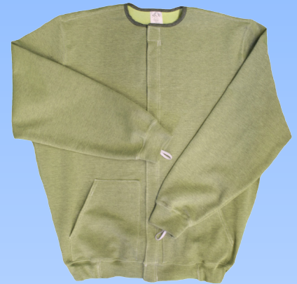
X-Factor Full-Zip Sweatshirt Model # C21CH__06