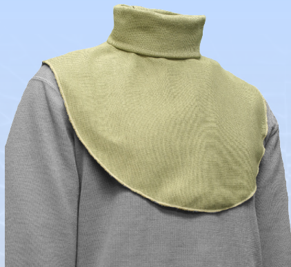
X-Factor Dickey Model # H01CH016VC