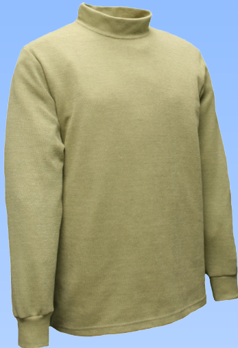
X-Factor Mock Turtleneck Sweatshirt Model # C54CH__TN

Featuring Garments Powered by X13™ Yarn!